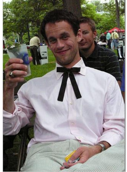
Gute weiss-blaue Fahrt,